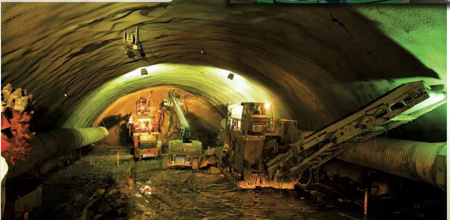
Tunnelling from Federation Street Site, Bowen Hills

Visit the 'Gallery' section of our project website to view the latest 3D animation of the Airport Link and Northern Busway tunnel alignment, and how Airport Link will connect with the Airport Roundabout Upgrade.