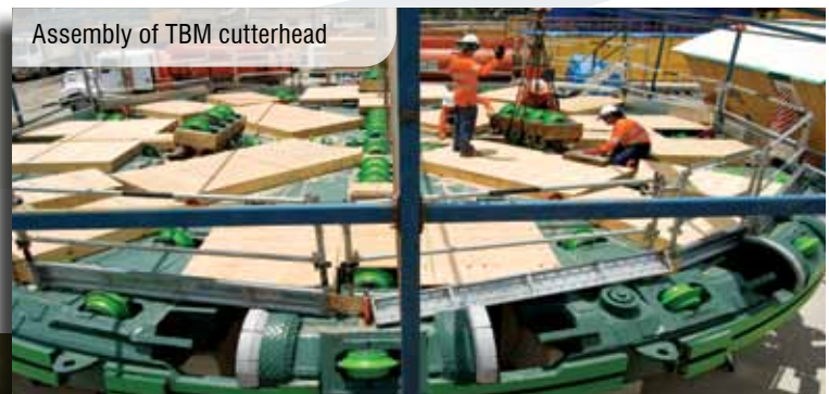
Assembly of TBM cutterhead

Our next Community Update Newsletter will feature information about the Airport Link ventilation stations, now in the early stages of construction near Mann Park, Bowen Hills; Gympie Road, Kedron; and Sandgate Road, Toombul.