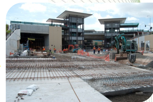
Top: New bus stop on Lutwyche Road near Windsor State School