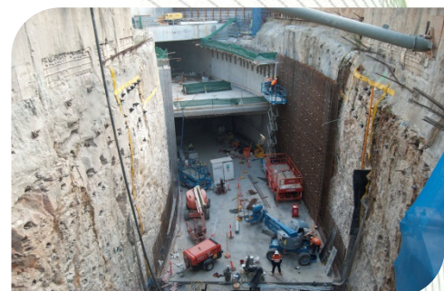
Top: Aerial view of Kedron precinct