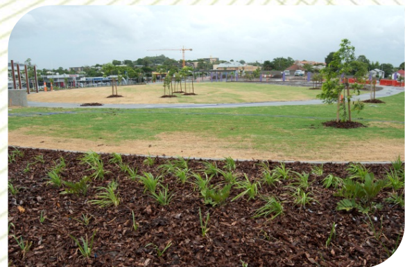
Top: Demobilisation of the Toombul acoustic shed