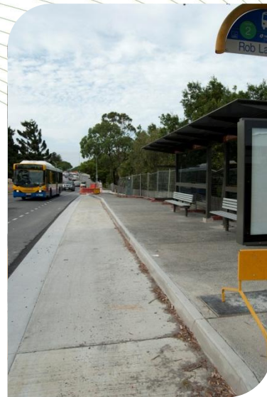
Top: Aerial view of Lutwyche Busway Station