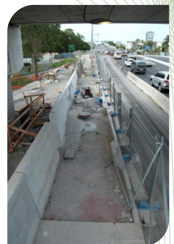
Top: Installation of living green wall baskets