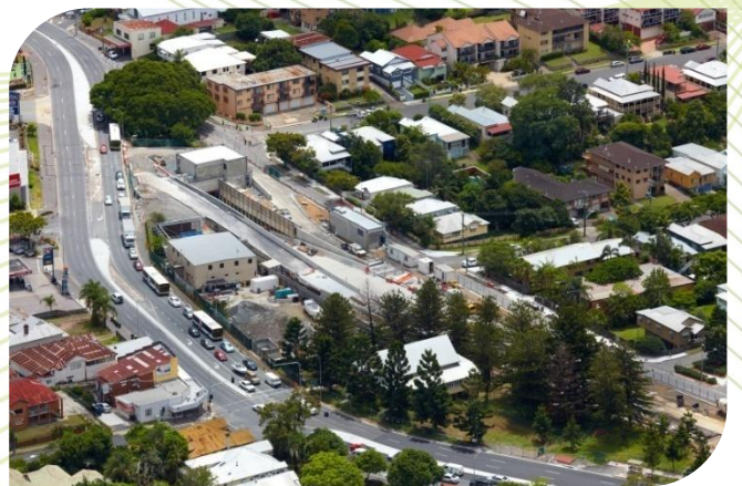
Top: Aerial view of the Truro Street site showing the decline ramp