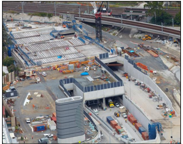
Kalinga Park East Worksite