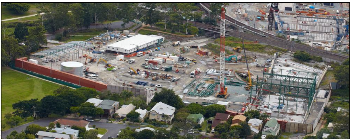
Kalinga Park West Worksite